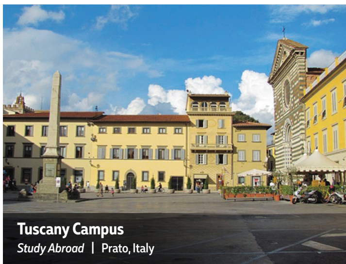
Tuscany Campus Study Abroad | Prato, Italy

2806 Azalea Place, Nashville, TN 37204 The Metropolitan Nashville Police Department responded with no reportable crimes at this location for reporting years 2016, 2017, or 2018.