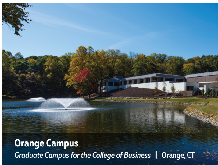
Orange Campus Graduate Campus for the College of Business | Orange, CT