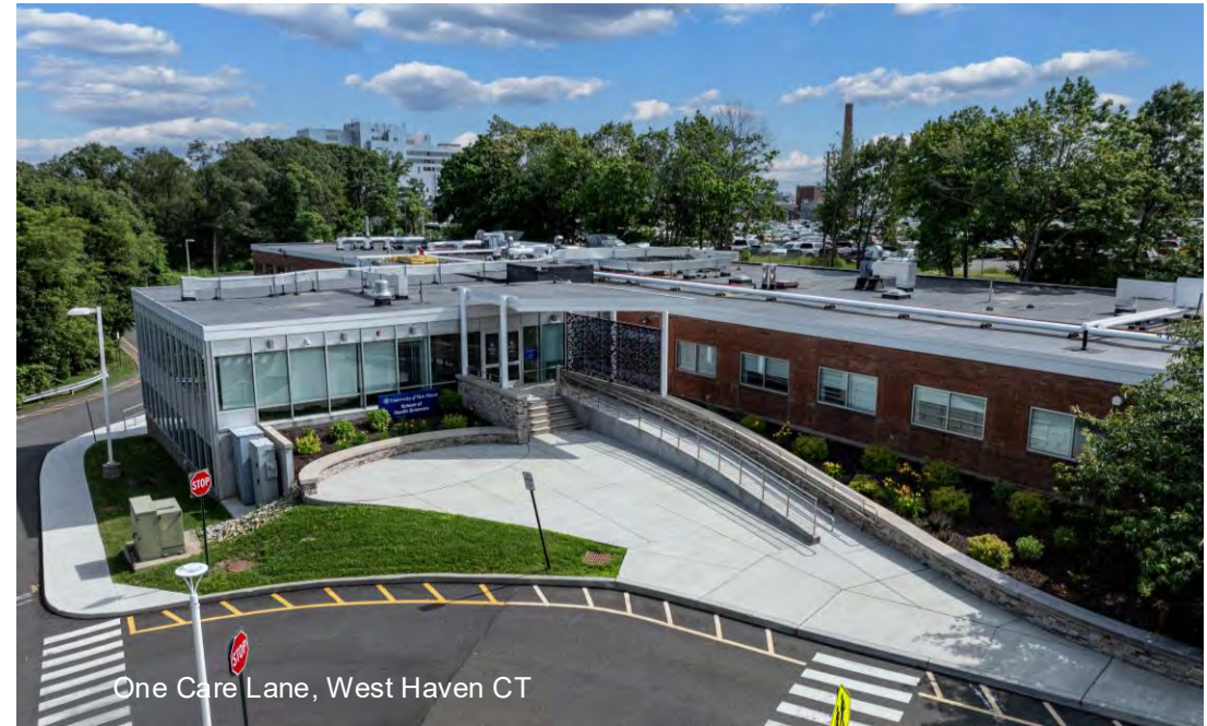
One Care Lane, West Haven CT

We have partnered with local, state, and federal agencies in an effort to enhance our students safety while traveling abroad.