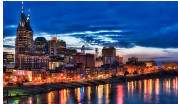
Nashville Study Away Program Nashville, TN