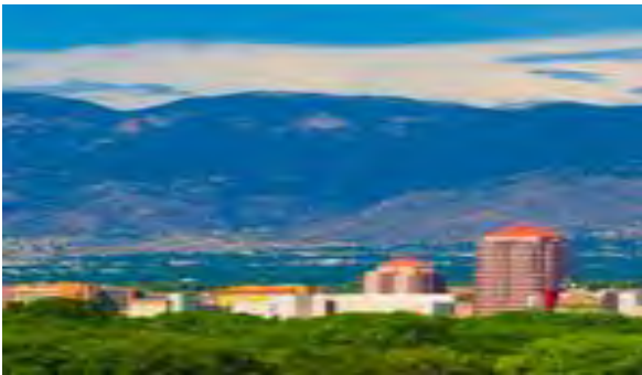
National Security Program Kirtland Air Force Base, Albuquerque, NM