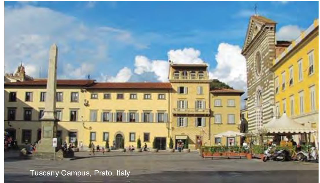
Tuscany Campus, Prato, Italy